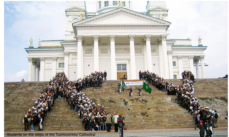
Students on the steps of the Tuomiokirkko Cathedral