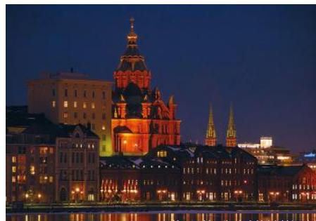
Uspenski cathedral, Helsinki tourist & convention bureau, N. Sjöblom