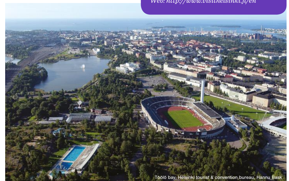
Töölö bay