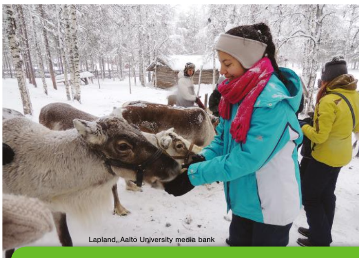
Lapland