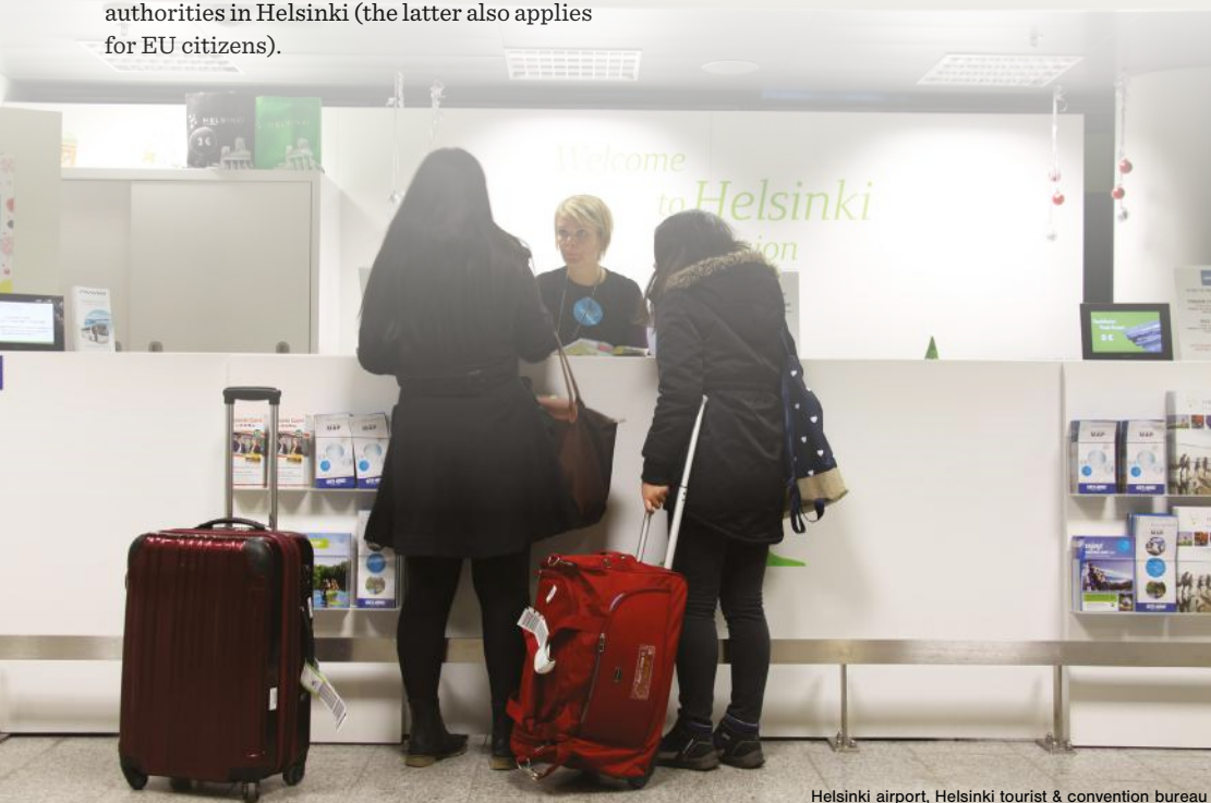
Helsinki airport

Helsinki-Vantaa airport is located in Vantaa, about 20 kilometres from the centre of Helsinki. The bus journey from the airport to the centre of Helsinki takes about 30–35 minutes. The Finnair bus runs more frequently and takes a bit less time than the local bus number 615. The Finnair bus costs 6,30 euros and the bus number 615 or 615T 5 euros (May 2015). The final stop for both buses is the Central Railway Station located in the centre of Helsinki.