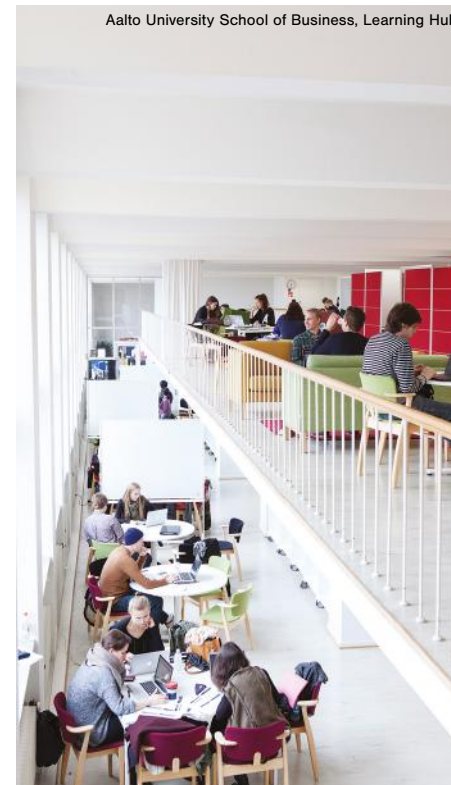
Aalto University School of Business, Learning Hub

of the campuses include e.g. library services, study and computer facilities, student cafeterias etc. Benefits for members of AYY (Aalto University Student Union) include inexpensive medical care ( www.yths.fi ), cultural events and sports facilities ( www.unisport.fi ). AYY members also receive significant discounts in student cafeterias in our own campuses as well as any other student cafeteria around Finland. A hot meal for a AYY member costs only about 2.60 euros.