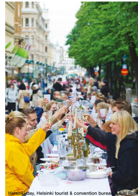
Helsinki day

Information and brochures: Helsinki City Tourist Information Visiting address: Pohjoisesplanadi 19. Tel. + 358 (0)9 3101 3300 E-mail: tourist.info@hel.fi Web: http://www.visithelsinki.fi/en