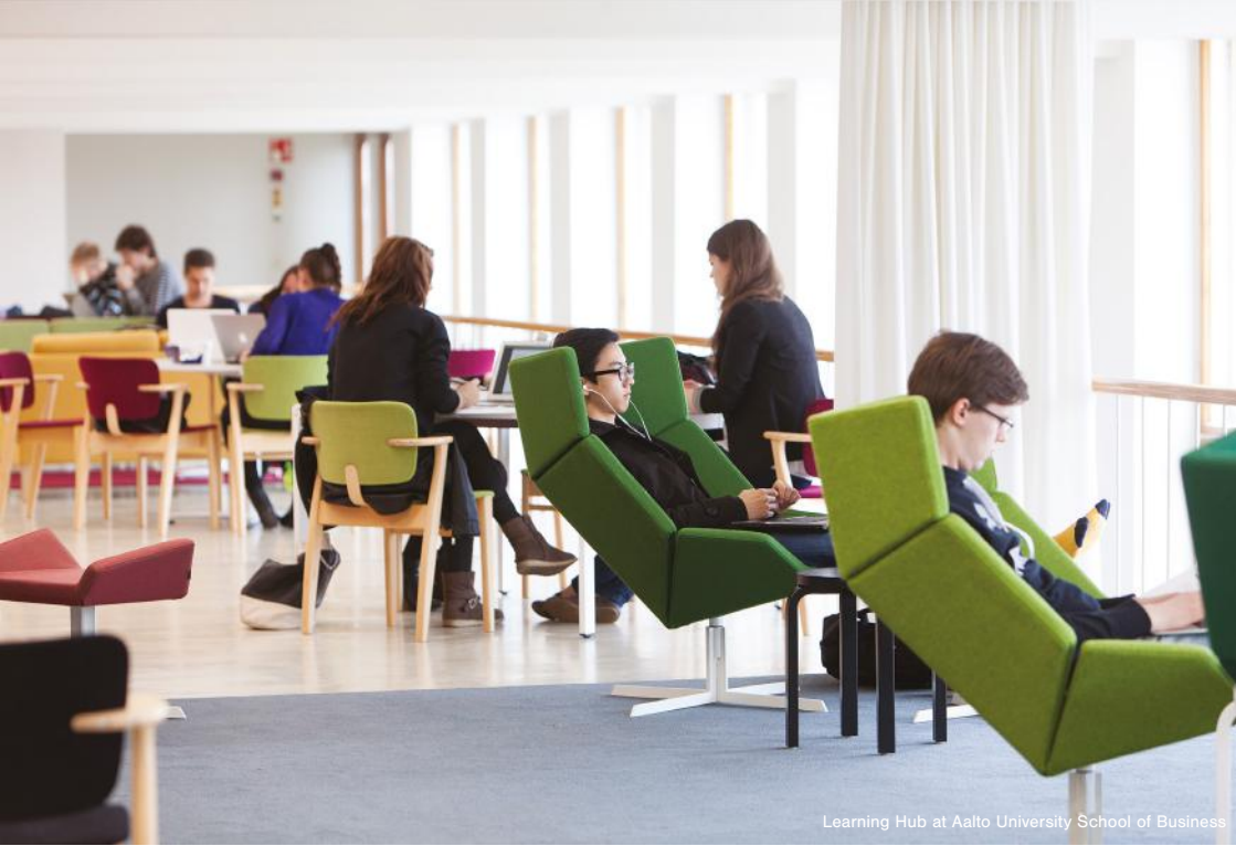
Learning Hub at Aalto University School of Business