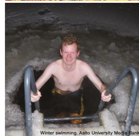
Winter swimming