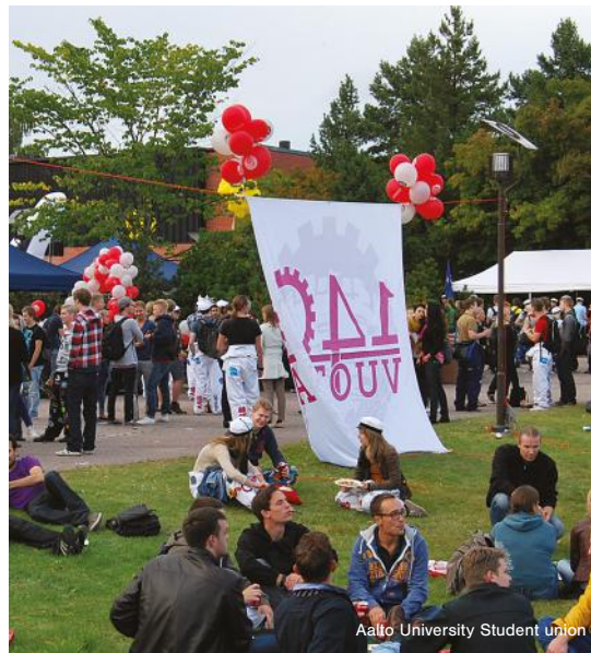
Aalto University Student Union