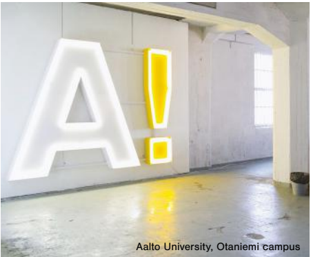
Aalto University, Otaniemi campus

We offer several programmes from which a student will graduate with a Bachelor of Science or Master of Science degree in Economics and Business Administration.