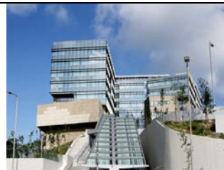
Photo: Lee Shau Kee Business Building