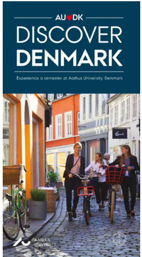
Cover page for a couple of our brochures